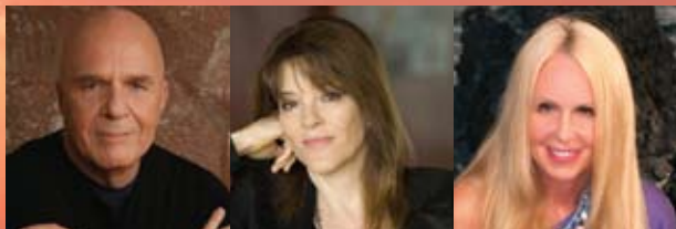
DR. WAYNE W. DYER

Inspiring Keynote Lectures and Workshops with Over 20 of Your Favorite Hay House Authors on a Wide Range of Enlightening Topics! Opening remarks from Louise L. Hay!