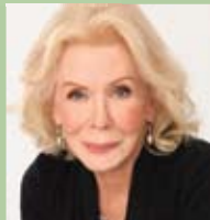
LOUISE L. HAY